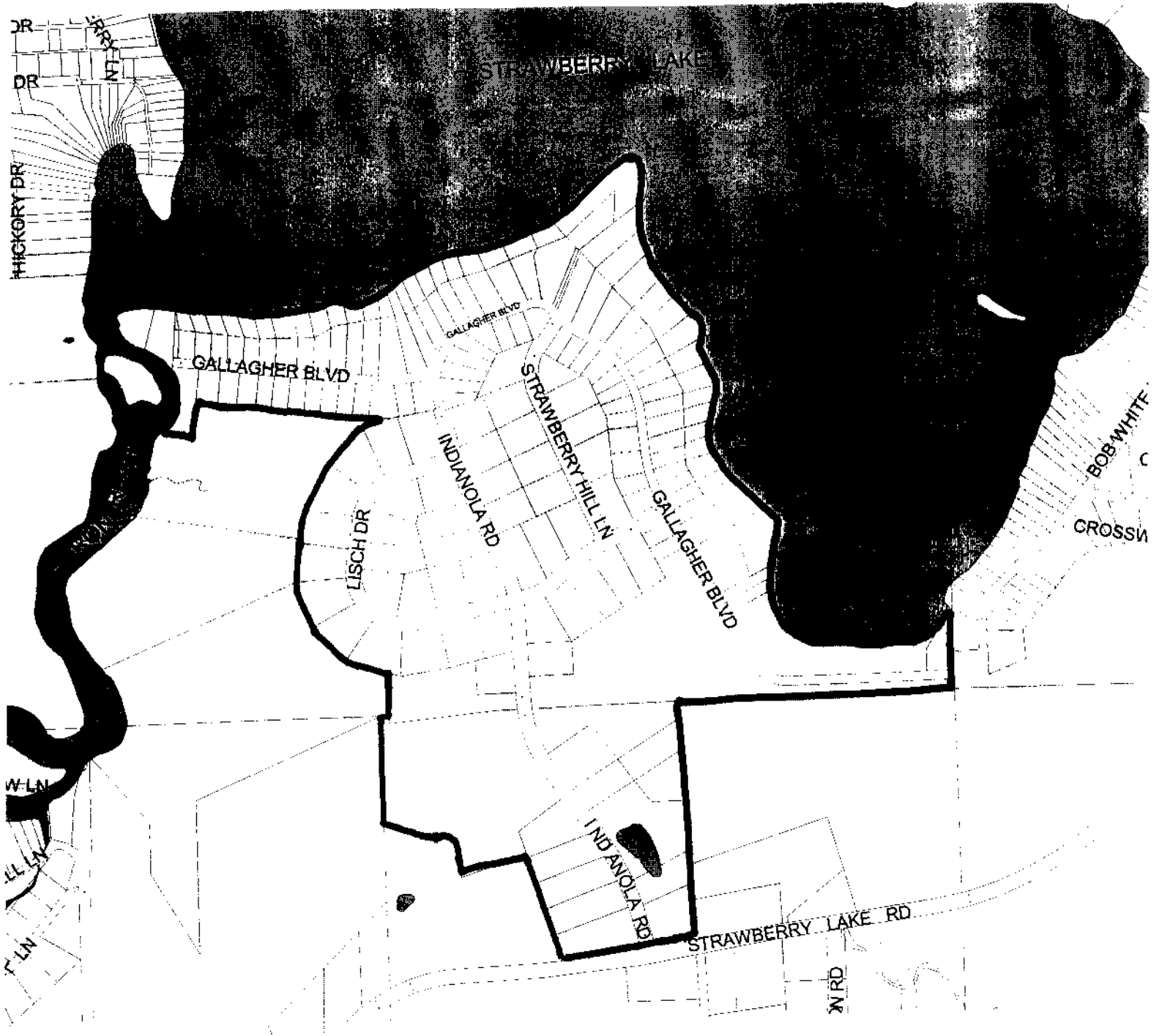
General service area establishing the Strawberry Hills Estates Area – Road Re-Paving Special Assessment District.

The general service area in which a proposed special assessment district is to be designated. The district boundaries may be determined by property owner response.